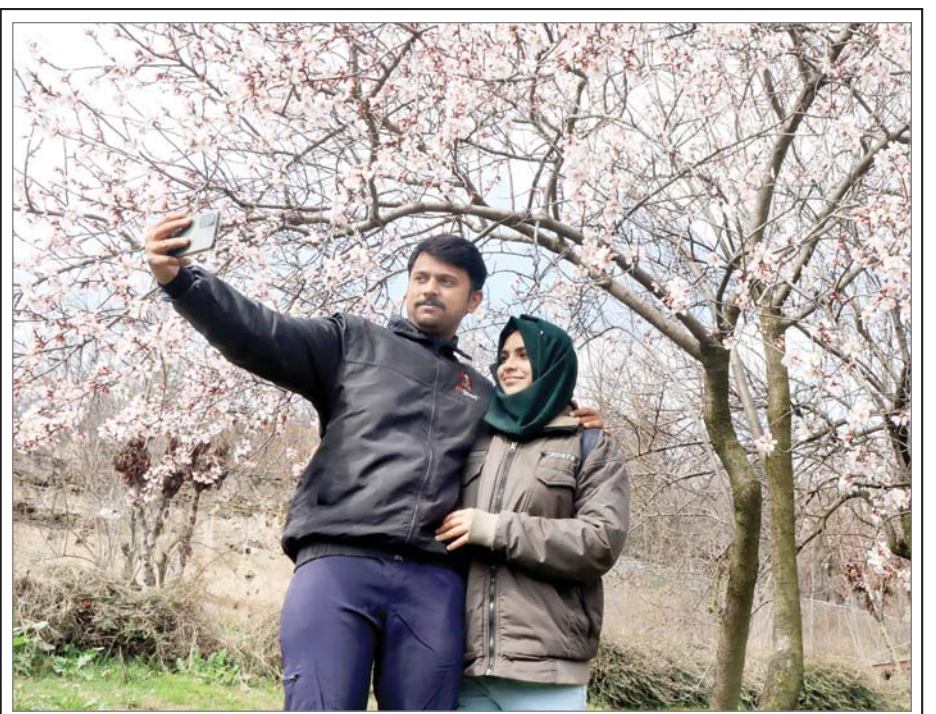
Almond blossoms attract tourists in Srinagar's Badamwari Garden.

ing Delhi's school education. His arrest will be cited worldwide as an example of a political witch-hunt and further confirm what the world was only suspecting - that India's democratic values stand threatened under an authoritarian BJP regime, they alleged. Citing Assam Chief Minister Himanta Biswa Sarma and former TMC leaders Suwendu Adhikari and Mukul Roy as examples, the leaders claimed that the investigation agencies go slow on cases against opposition politicians, who join the BJP. "Since 2014, there has been a marked rise in the number of raids conducted, cases lodged against and arrest of the Opposition leaders. Be it Lalu Prasad Yadav (Rashtriya Janata (Contd on page 4 Col 3)