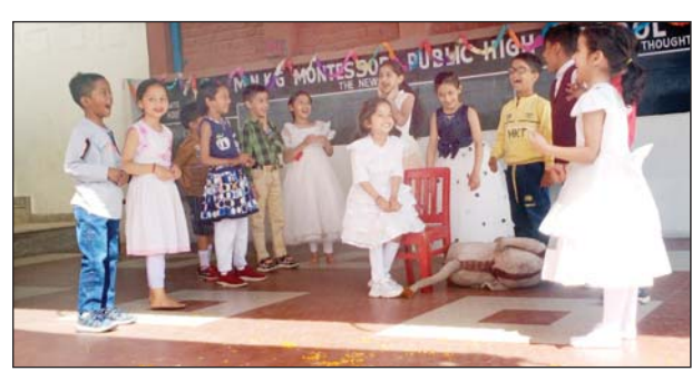
Toddlers performing a cultural item during the annual day function at Jammu on Sunday.

In this connection, a case FIR number 122/2023 under relevant sections of law have been registered at Police Station Udhampur and further investigation of the case has been taken up.