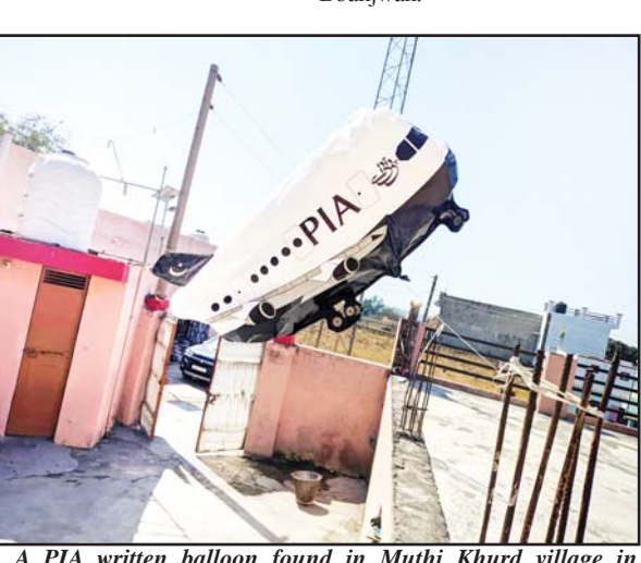
A PIA written balloon found in Muthi Khurd village in Samba District on Sunday.