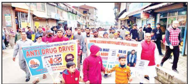
People during anti-drug drive in North Kashmir's Bandipora on Sunday.

Excelsior Correspondent SRINAGAR, Mar 5: Jammu Kashmir Nationalist People's Front (JKNPF) today held a massive walkathon against drug addiction in North Kashmir's Bandipora. The event was organized with the aim of raising awareness about the dangers of drug addiction and promoting a drug-