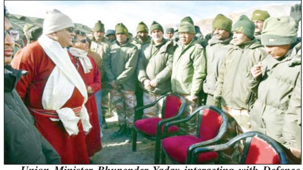
Union Minister Bhupender Yadav interacting with Defence personnel at a village in Leh.

During the visit, the Union Minister also called on Ladakh's Lieutenant Governor BD Mishra