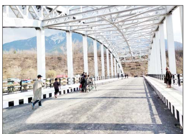
A view of beautifully designed Wayil bridge in Ganderbal district.

An official privy to the details said the two-lane bridge, with a span of 110 meters and a