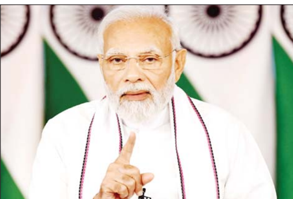
Prime Minister Narendra Modi addressing post budget webinar on 'Health and Medical Research' in New Delhi on Monday.

Prime Minister Narendra Modi said today that life-savers like medicines, vaccines and medical devices were weaponised when the COVID-19 pandemic was at its peak, and asserted that his Government has been consistently trying to minimise India's dependence on foreign