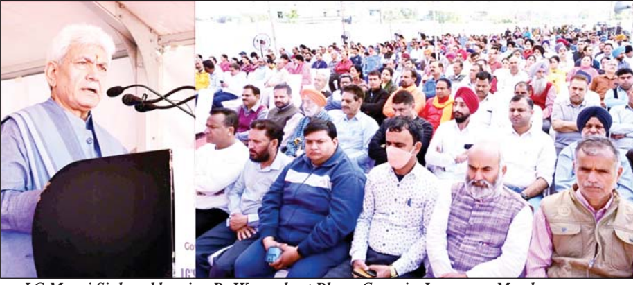
LG Manoj Sinha addressing PoJK people at Bhour Camp in Jammu on Monday.

them, he said: "I have no doubt that one day the dream of 'Akhand Bharat' conceived by our elders will be a reality". His