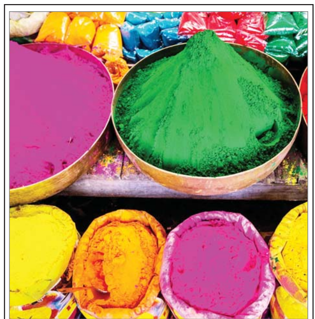
Excelsior extends Holi Greetings to all its readers. Offices of Daily Excelsior and Excelsior Printers Pvt Ltd will remain closed on March 7 (Tuesday) on account of Holi festival. Therefore, there will be no issue of your newspaper on March 8 (Wednesday). -- Editor