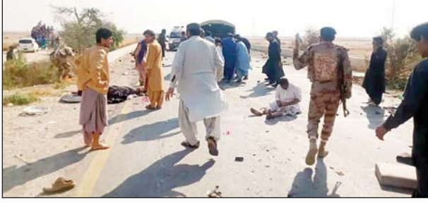
Paramilitary soldiers and volunteers work at the site of a suicide bombing, in Baluchistan province on Monday.

At least nine personnel of the Balochistan Constabulary were killed and 13 were injured in the (Contd on page 4 Col 5)