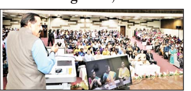
Union Minister Dr Jitendra Singh, as chief guest, addressing the International Women's Day programme organised by the Council of Scientific & Industrial Research (CSIR) at New Delhi, on Thursday.

NEW DELHI, Mar 9: To mark the International Women's Day, Union Minister of State (Independent Charge) Science & Technology; Minister of State (Independent Charge) Earth Sciences; MoS PMO, Personnel, Public Grievances, Pensions, Atomic Energy and Space, Dr Jitendra Singh today announced an exclusive women's portal for research grants and funds. The portal will become functional with effect from 1st of April.