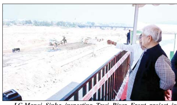
LG Manoj Sinha inspecting Tawi River Front project in Jammu on Saturday.

Our doors are always open for dialogue. Suggestions aimed at simplification of tax and faci-