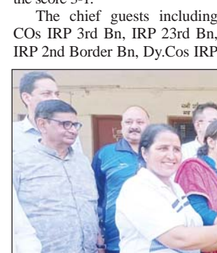
Trophy being presented to Captain of winning team by dignitaries at Jammu on Wednesday.

The match between Mizoram Police Vs Jharkhand Police was won by Mizoram Police and ended with a score of 5:1. The match between Assam Rifles Vs Puducherry Police was won by Assam Rifles by 10-0. At Synthetic Turf Ground, the matches were played between Manipur Police Vs Meghalaya Police, Himachal Pradesh Police Vs Chandigarh Police, RPF Vs West Bengal Police and Odisha Police Vs Maharashtra Police.