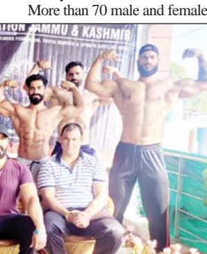
Bodybuilders team posing for a group photograph at Jammu on Wednesday.

fencers drawn from different institutions and clubs of the district participated in the championship. On the final day of the event, three finals were played in senior epee girls, senior foil boys and senior epee boys.