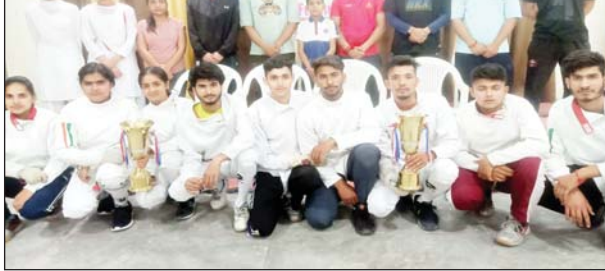
Bodybuilders team posing for a group photograph at Jammu on Wednesday.