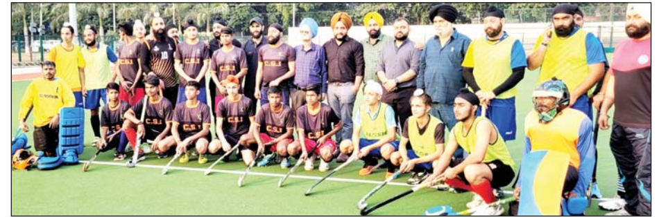
Players posing for a group photograph along with dignitaries at Jammu on Wednesday.