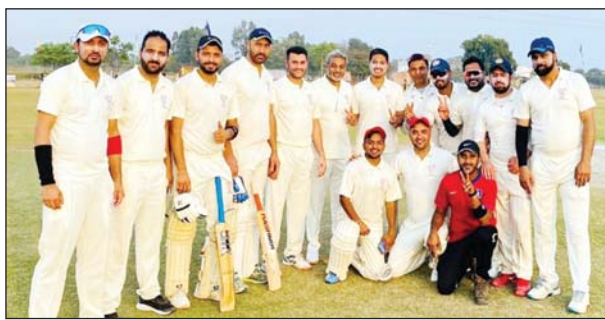
Jubilant J&K Civil Services team posing for a group photograph after registering win over Punjab on Wednesday.

half-century, falling for 46 off 32 balls with five fours and two sixes. Harris and Deepti led the recovery for UP Warriorz - tottering at one stage at 31/5 - with a brisk 69-run stand that took them past the 100-run mark. Harris made most of a lifeline given by Richa Ghosh, who missed a regulation stumping off Sobhana Asha when the batter was only on nine. Devine set the tone in RCB's favour with two wickets in the first over to return with 4-0-23-2. Sobhana Asha got plenty of turn during a largely impactful 4-0-27-2 and Megan Schutt produced a measly spell of 4-0-21-1 to cap off a combined bowling show for RCB. Earlier before the start of the contest, the former RCB captain Virat Kohli met the team and also had a talk with Mandhana, whose torrid run with the bat continued. In their previous meeting at the Brabourne Stadium on March 10, UP Warriorz had crushed RCB by a massive 10-wickets in a one-sided game with Alyssa Healy scoring a stunning 96 not out in the winning cause. (PTI)