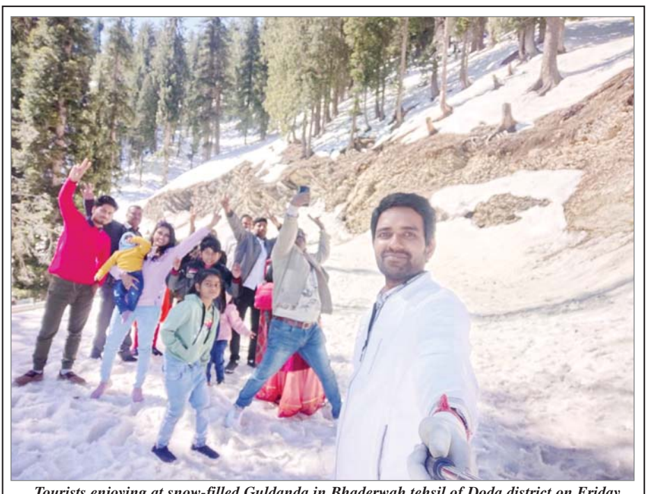
Tourists enjoying at snow-filled Guldanda in Bhaderwah tehsil of Doda district on Friday.