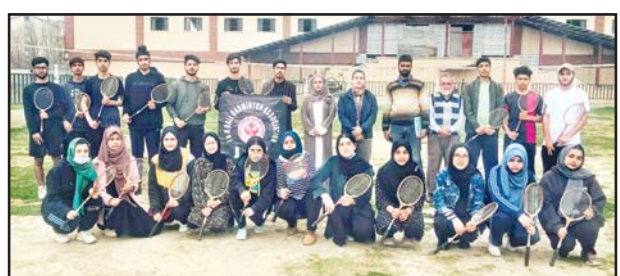
Selected players posing for a group photograph at Gindun Stadium in Srinagar on Saturday.