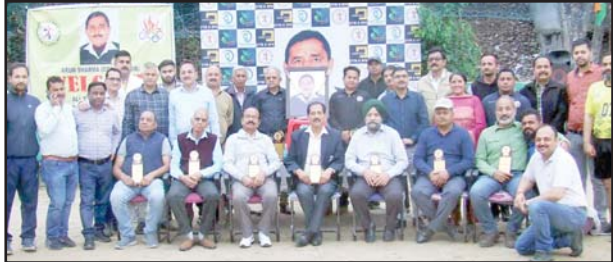
Awardees posing for a group photograph at SD Sabha School Rehari on Saturday.

All the equipments which included climbing ropes, harnesses, quick draws, carabiners, maillon rapids etc. conform to