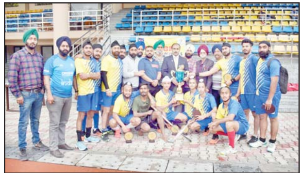
Winners being awarded with a trophy by dignitaries at Jammu on Saturday.