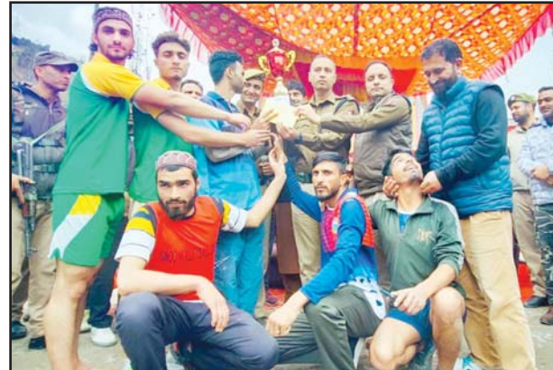
Winners being awarded with trophy by Police officials at Thathri on Saturday.