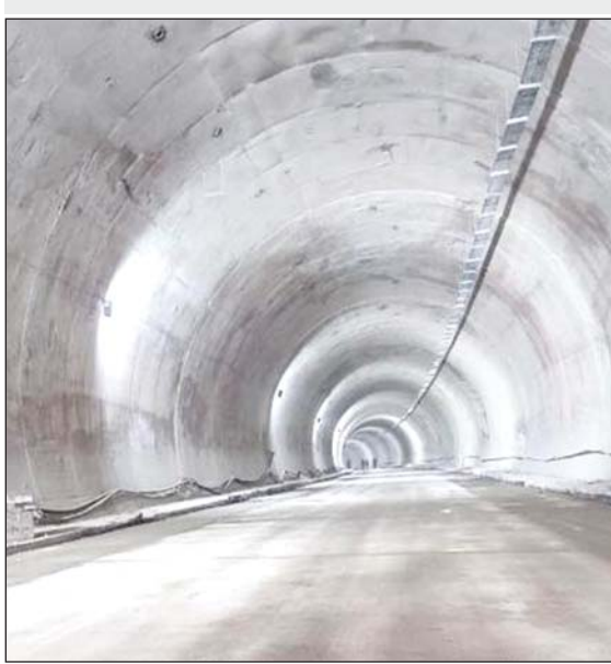
A picture of the tunnel tweeted by Union Minister Nitin Gadkari on Wednesday.

This will also provide reliable connectivity to traffic bound for Kashmir under all weather conditions, the Union Road, Transport and Highways Minister said.