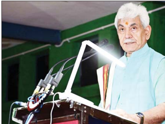
LG Manoj Sinha addressing sportspersons in Jammu on Wednesday.

"It was unfortunate that country had to take long time to give respect and place to the sportspersons they deserved," Sinha said. He added that no society can