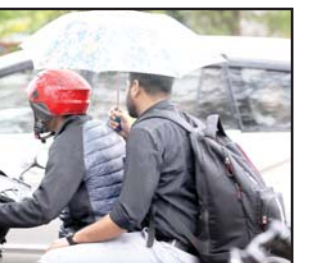
Braving rain, two scooterists taking umbrella cover while moving through a Jammu road on Friday. (Contd on page 4 Col 3)

A Met official said that there was a possibility of hailstorm in the