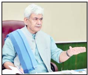
consumers and help them to conserve energy and usage in an efficient manner, the Lt Governor said.

Smart meters must be saturated feeder-wise to protect consumer interests and quality standards. It will empower the