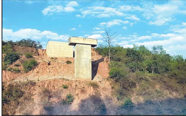
Pillars of the span bridge, work on which has been left halfway by the contractor.

To be constructed at the cost of Rs 20 crores in two years, i.e. by February 2020, the bridge is still awaiting its completion till date as the work is lying stopped