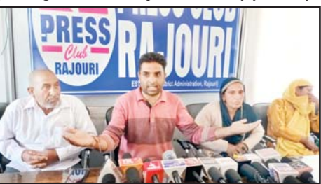
Dhangri terror attack victims addressing a press conference in Rajouri on Monday.

bring them to justice. Terrorists had struck Dhangri village on January 1 and targeted villagers and fled before planting an improvised