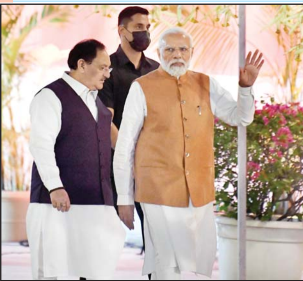
Prime Minister Narendra Modi with BJP president JP Nadda at the party Central Office (Ext.) in New Delhi on Tuesday. attacking its foundation and are engaged in conspiracies to defame bodies such as the judiciary and probe agencies and destroy their credibility, he said. "The 'anti-India' forces are attacking constitutional institutions as they are the strong 'foundation' of a rising India, he said. And, to stop the country's growth, they are resorting to

courts deliver a verdict not to the liking of these forces, they are questioned, the Prime Minister said. "Some people are bound to get angry when we act so much against corruption," he said. Never before in the history of independent India, such a big campaign against corruption has taken place and it has rattled the corrupt. "All those involved in corruption have come onto one platform," he said, asserting that people realise that when the BJP comes to power, corruption goes away. Citing figures, Modi said that during the Congress-led UPA rule between 2004 and 2014, assets worth Rs 5,000 crore were seized under the Prevention of Money Laundering Act, while the figure has zoomed to Rs 1.10 lakh crore in the nine years of the BJP rule. The cases registered under the act more than doubled under his Government while the number of the arrests surged 15 (Contd on page 4 Col 3)