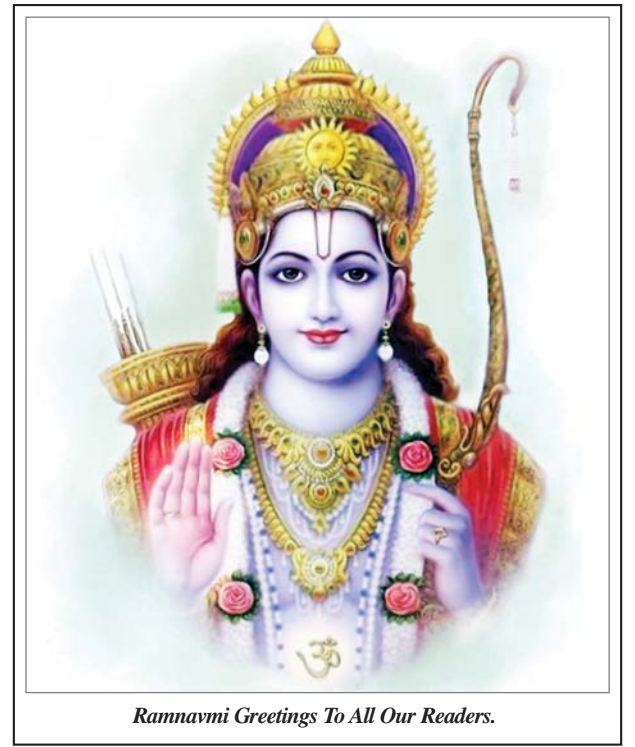
Ramnavmi Greetings To All Our Readers.