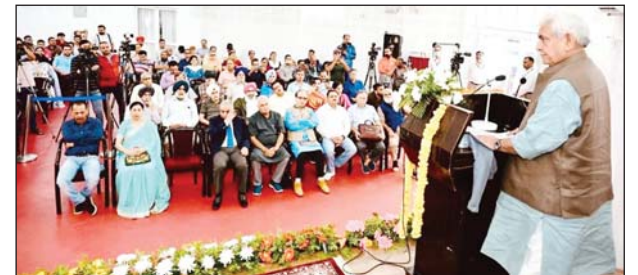
Lt Governor Manoj Sinha paying tribute to Sarwanand Koul Premi on his death anniversary at Jammu on Monday.

said. Remembering Sarwanand Koul Premi, the LG said he was a towering man of ideas and ideals. He was undoubtedly one of the greatest writers of his time with deep commitment for upliftment of the downtrodden and weaker sections of society, Sinha said.