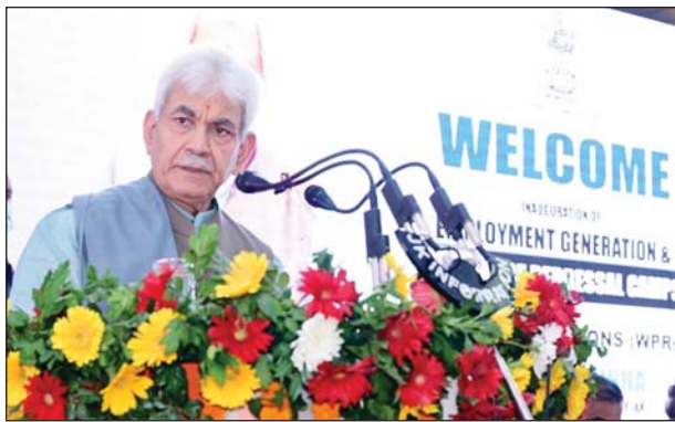
LG Manoj Sinha speaking at Special Governance Camp for WP refugees in R S Pura on Monday.

A formal announcement to this effect was made by the Lieutenant Governor today.