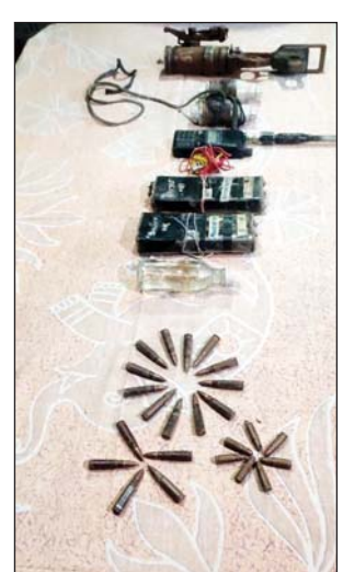
Explosives and ammunition recovered in Ramban on Monday.

The recoveries made from the hideout included an Under Barrel Grenade Launcher (UBGL) thrower, two rifle grenades, a