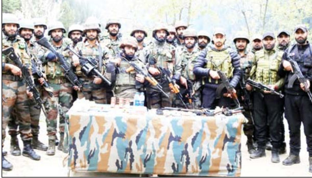
Security personnel with recoveries at Machil sector on Wednesday.

"A well-coordinated counter infiltration grid was put in place in this rugged and extremely difficult area. A number of additional ambushes including those of