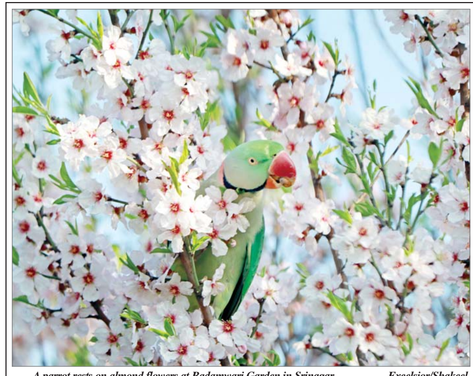
A parrot rests on almond flowers at Badamwari Garden in Srinagar.

The unit holders requested (Contd on page 4 Col 1)