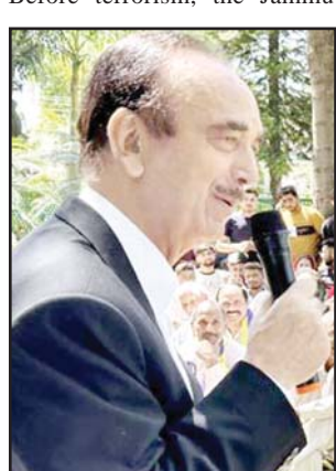
DPAP leader also reiterated his demand for holding of early Assembly elections in Jammu and Kashmir. Earlier, addressing a gathering during a function, Azad said if his party is elected to power, he will ensure equitable and balanced development in all the regions. He regretted that the remote and rural areas were being ignored in all respects by the UT administration.

suffers huge losses and is forced into poverty and illiteracy. Before terrorism, the Jammu