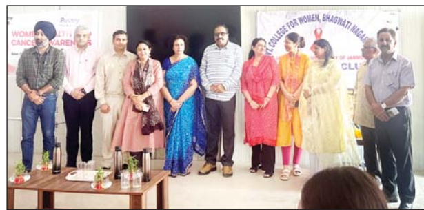
Rotary Club Jammu members and others pose for a group photograph after an awareness camp at Govt College of Women Bhagwati Nagar.