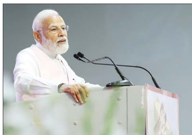
Prime Minister Narendra Modi addressing at the inauguration of International Museum Expo 2023 at Pragati Maidan, in New Delhi on Thursday.

unveiled the mascot of the International Museum Expo, a graphic novel titled "A day at the Museum", a directory of Indian museums, a pocket map of Kartavya Path, and museum cards.