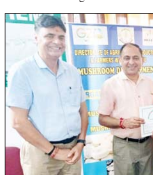
A trainee gets certificate during a valedictory function in Jammu on Thursday.

The training programme module was designed with all the