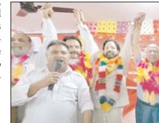
NC leaders during a meeting at Kathua on Saturday.