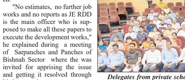
Delegates from private schools of Jammu division pose for a group photograph during a workshop.