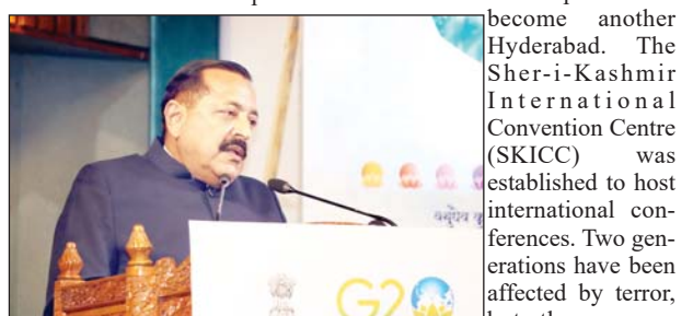
Union MoS in PMO Dr Jitendra Singh addressing the delegates at Srinagar on Monday.

Excelsior Correspondent SRINAGAR, May 22: Union Minister Dr Jitendra Singh today said that Kashmir has undergone transformation and there are no takers for the strike calls given by Islamabad as people have moved on. The Minister while addressing the delegates from G20 countries at a side event on "Film Tourism for Economic and Cultural Preservation" said Singh told reporters that there has been set back to the development and progress of Kashmir after 1990. "I believe that Kashmir had the potential to become another Hyderabad. The Sher-i-Kashmir International Convention Centre (SKICC) was established to host international conferences. Two generations have been affected by terror, but the younger generation has realized the importance of not wasting their energy and youthful years on it. Kashmir is an integral part of PM Modi's vision for progress," he said. Residency Road (in the city centre of) Srinagar would close. Now there is no hartal even if the call for hartal has come from here or there."