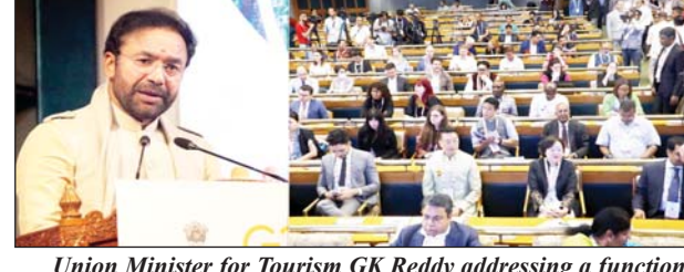
Union Minister for Tourism GK Reddy addressing a function in Srinagar on Monday.

ratations, and the Government has approached all States, and discussions are going on. Our idea is that without private investment we cannot become a world tourist destination that is why we want investment globally and locally. We cannot become a world tourist destination, which is why we want investments globally and domestically, and we are also encouraging 100% FDI under Modi," he said. Reddy said that G20 events are being held across the country. "In every State of the country, G20 events are being held. It's a great pride for Srinagar to host a mega event. This event will surely pay back in the form of rise in the tourist influx," he said. He said this was just the beginning as India is all set to host the Global Tourism Investment Summit. 60 delegates arrive About 60 foreign delegates arrived here today for the third Tourism Working Group meeting of the G20 countries that will begin here tomorrow. Lt Governor Manoj Sinha will inaugurate the meeting tomorrow morning at SKICC Srinagar. This is the first international meeting being held in Kashmir after the abrogation of Article