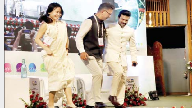
Actor Ram Charan dancing along with other delegates on the tunes of blockbuster song Natu Natu during the ongoing G20 meeting at SKICC on Monday.

Excelsior Correspondent SRINAGAR, May 22: The Film star Ram Charan today said that Kashmir is an untapped destination for the film industry and it will take 95 years for them to explore it. The actor was speaking at the Film Tourism for Economic and Cultural Preservation event here at Sher-i-Kashmir International Convention Centre (SKICC), being hosted as a part of the three-day Tourism Working Group Meeting of the G20 countries. While highlighting the potential for filming in Kashmir, the Telugu star said that it is an untapped destination and will take them another 95 years to explore Kashmir. Meanwhile, in a significant