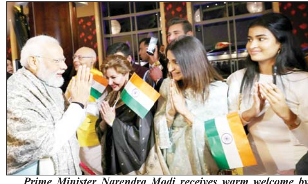
Prime Minister Narendra Modi receives warm welcome by Indian community in Sydney on Monday. (UNI)

PORT MOREBY, May 22: Eyeing to bolster India's footprint in the Indo-Pacific, Prime Minister Narendra Modi today showcased New Delhi as a reliable partner of the Pacific Island nations as he said those considered trustworthy were not standing by the region in times of need, in what is being seen as an oblique reference to China. A friend in need is a friend indeed, Modi told top leaders of 14 Pacific Island nations at a summit, assuring that India is ready to share its capabilities and experiences with the region without any hesitation and that we are with you in every way. Referring to adverse impact of COVID-19 pandemic and other global developments, Modi said India stood by the Pacific Island nations in the challenging time and conveyed to them that they can rely on New Delhi as it respects their Prime Minister Narendra Modi receives warm welcome by Indian community in Sydney on Monday. (UNI) The Mumbai tourist whose