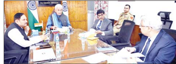
LG Manoj Sinha chairing the AC meeting in Srinagar on Monday.