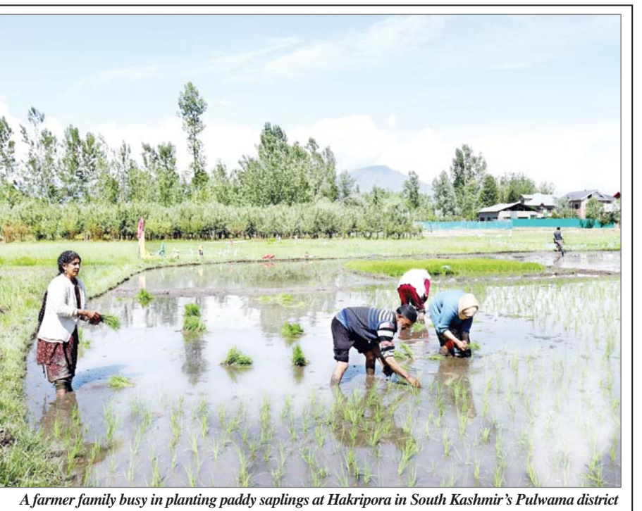
A farmer family busy in planting paddy saplings at Hakripora in South Kashmir's Puvama district on Thursday.