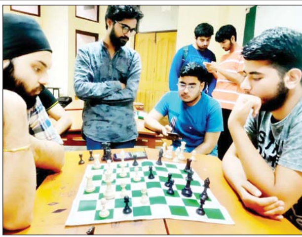
Players evincing keen interest in a Chess game during Sports Meet at GCET Jammu on Thursday.