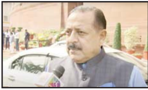
Union Minister Dr Jitendra Singh speaking to the media outside the new Parliament building at New Delhi on Sunday.

Parliament building and will now be spending the rest of the five-year Parliamentary term in the new Parliamentary building. He said, right from the day the independent India adopted the Westminster pattern of parliament based on Lower House and