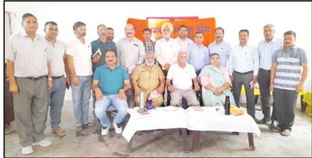
BMS functionaries during meeting in Reasi.

An iron hook and four luminous strips were also found attached to the consignment, it said. (PTI)