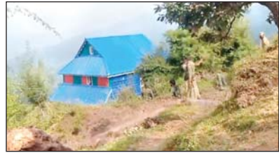
Security personnel near the site of encounter at Gali Sohob in Chasana area of Reasi district.

that two militants were trapped in a joint operation by Army, CRPF and Police at Gali Sohob this morning