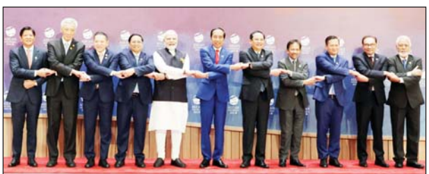
Prime Minister Narendra Modi in a photograph during the 20th ASEAN-India Summit in Jakarta, Indonesia on Thursday. ASEAN in a range of areas such as connectivity, trade and digital transformation even as he called to share New Delhi's digital public infrastructure stack with ASEAN (Contd on page 4 Col 5)

Excelsior Correspondent JAKARTA, Sept 7: Prime Minister Narendra Modi today presented a 12-point proposal to expand cooperation between India and 10-nation for building a rules-based post-COVID world order. Establishment of a multi-modal connectivity and economic corridor linking South East Asia, India, West Asia and Europe and offering