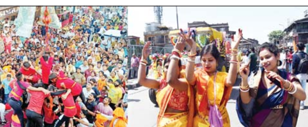
People celebrating Janamashtami in Jammu (left) and Srinagar (right).

*Watch video on www.excelsionews.com when priests performed the traditional prayers and rituals to mark the birth of Lord Krishna at 12 pm.