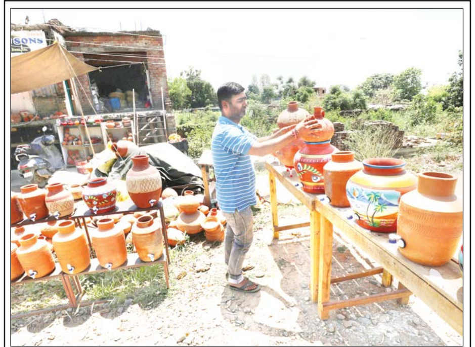
A vendor displays clay pots used to store drinking water on a hot day in Jammu.

These assets were frozen under Section 68F(2) of the NDPS Act by the Competent (Contd on page 11 Col 3)