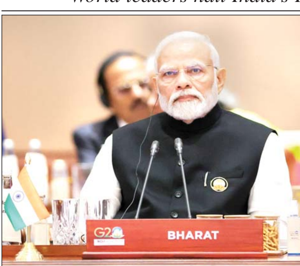
Prime Minister Narendra Modi at G20 Summit in Bharat Mandapam at Pragati Maidan in New Delhi on Sunday

In his concluding remarks at the final session of the two-day G20 summit, the Prime Minister also proposed a virtual session