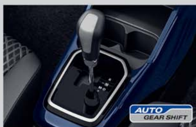
Auto Gear Shift