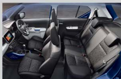
Spacious and Comfortable Interiors