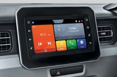
17.78 cm SmartPlay Studio (Available from Zeta variant onwards)