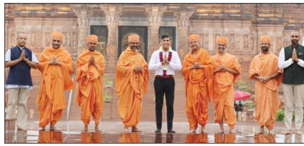
UK Prime Minister Rishi Sunak with wife Akshata Murthy visits the Akshardham Temple in New Delhi, on Sunday.

"My wife and I were delighted to visit Swaminarayan Akshardham for darshan and puja this morning. We were