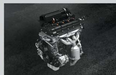
1.2L VVT Petrol Engine