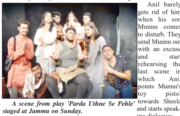
A scene from play 'Parda Uthne Se Pehle' staged at Jammu on Sunday.